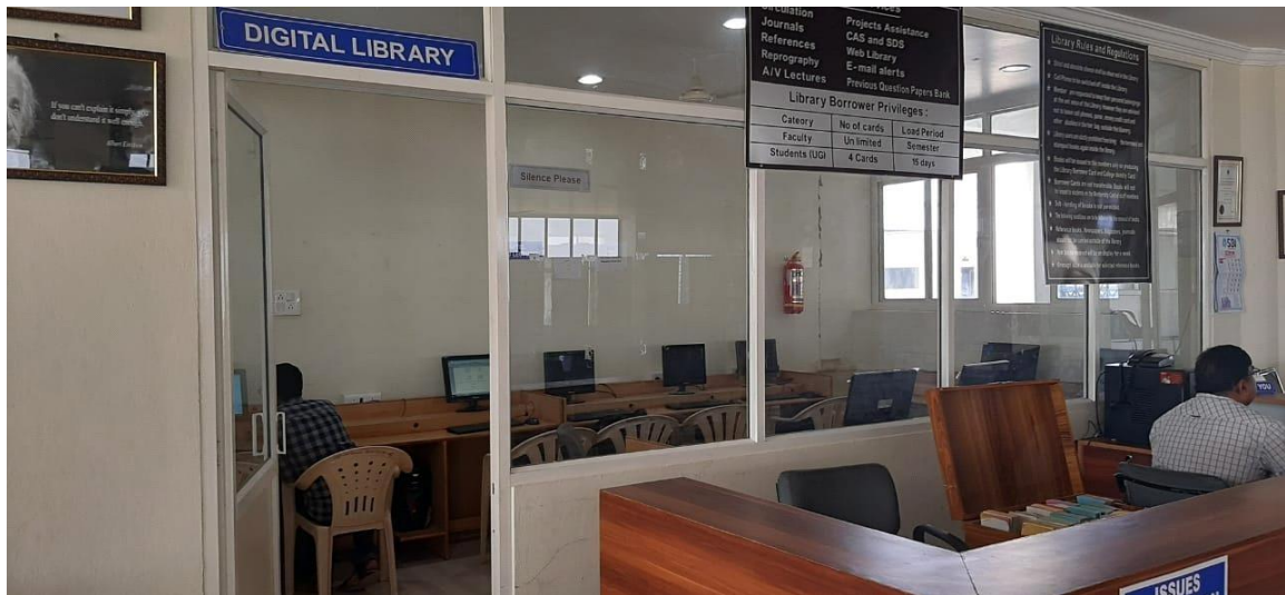
Fig.:6 Inner View of Virtual Library