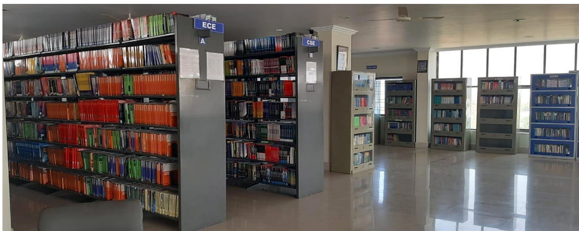
Fig.:2 UG Stock Area

Wing- : Stock Area, Reprography Service, Library office, collection Development and other technical Services.