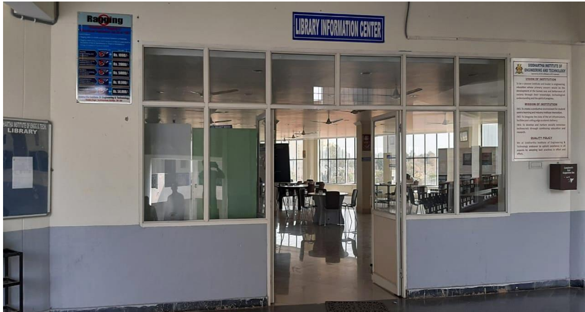
Fig.:1 Main Entrance