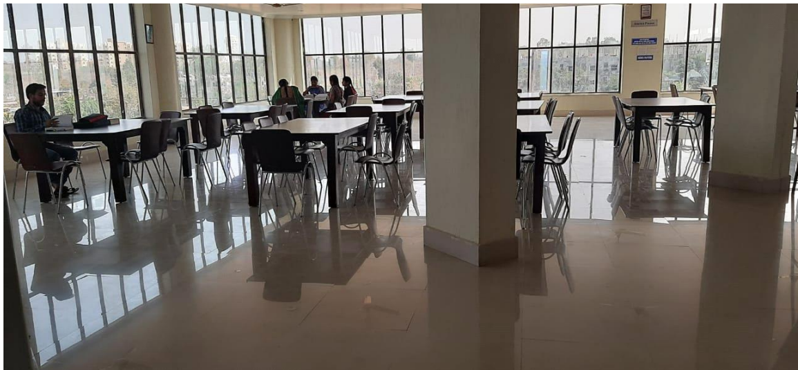
Fig.: 3 & 4 Reference Section and Reading Hall