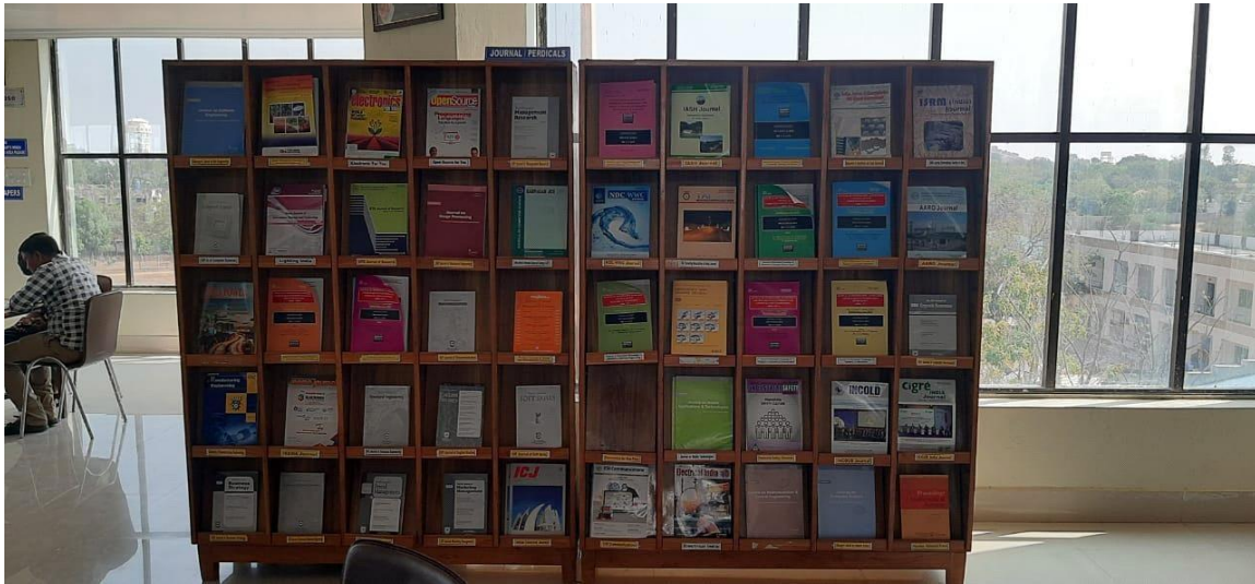
Fig.:5 Periodical Sections